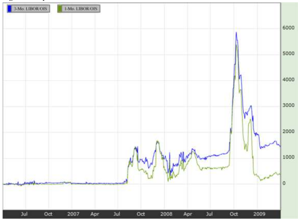
Figure 2: 3-year LIBOR/OIS Trend<sup>97</sup>

• TED Spread. The GAO highlights the TED spread, the difference between a LIBOR average and the interest rate on U.S. Treasuries of the same term, as a credit risk indicator: the higher the spread, the greater the perceived risk and the tighter the credit market.<sup>98</sup> The TED spread hit its peak in October 2008 but has since declined to a level near the low for 2008, which was a year of great volatility in the spread.<sup>99</sup>